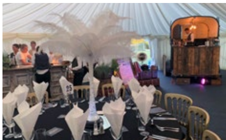
End of season ball setting up