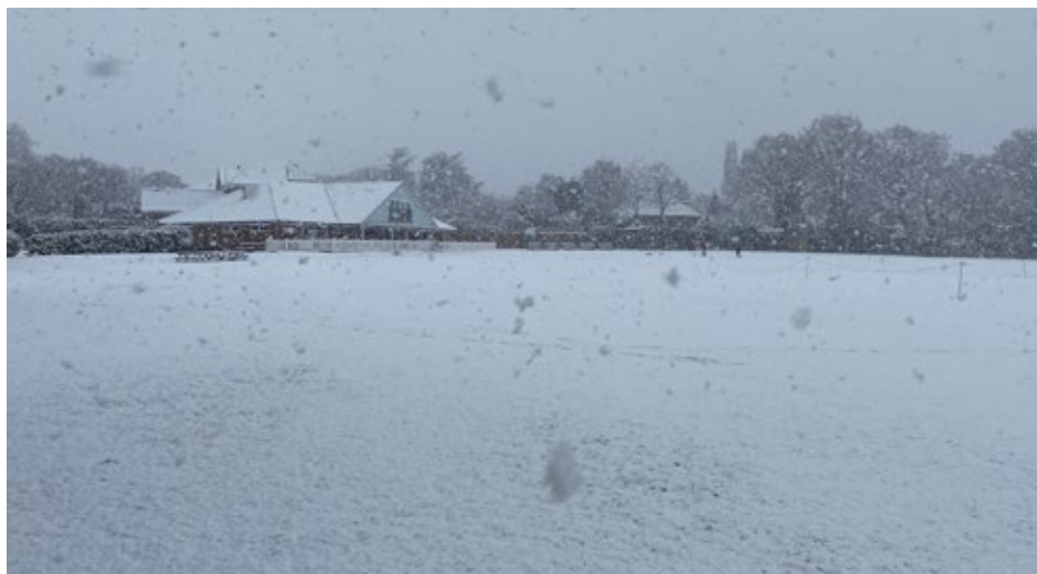
ECC in the snow