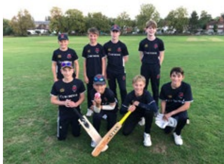
Winners – Esher 8-a-side Tournament