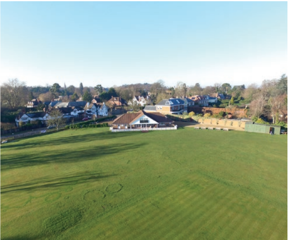
New Road from the air