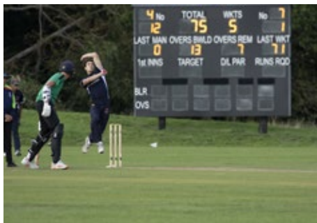
Senior Academy in action