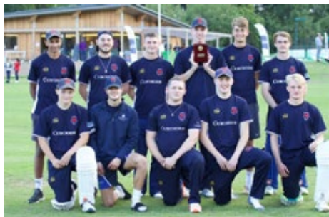
U19 – Winners of Surrey ECB T20 Blast