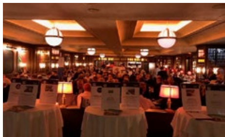
Guests at the City Lunch