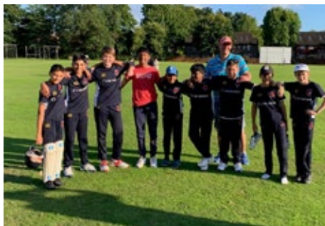
Under 11s winning the Ashtead 8-a-side tournament